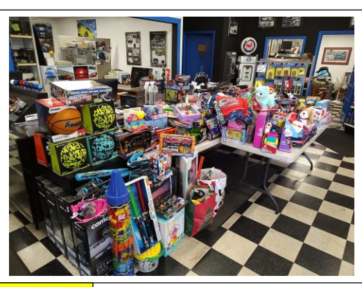
Stacks of Toys at Fastlane Motor sports in Benson.