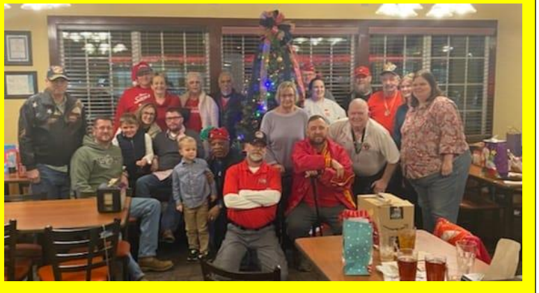
Our Christmas Dinner at Golden Corral